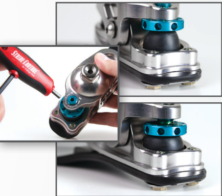
Adjusting the stride control up reduces heel resistance.

Stride Control allows for precise, incremental gait adjustments without any disassembly. Easily fine-tune the feel of the foot, increasing comfort and function for the user. A simple turn of a 4mm hex key changes the preload in the system for more or less resistance.