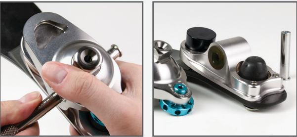
With only one pin to disassemble, the Venture requires minimal tools.

The Venture's bumpers and bushings can be swapped out as needed to increase and decrease resistance for a perfect feel. The bumpers were redesigned using aircraft-grade polymers for durability and longevity.