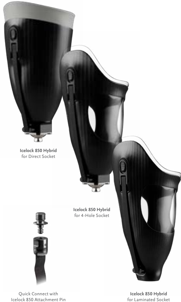
Icelock 850 Hybrid for Direct Socket