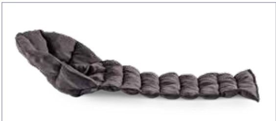
Chip Pad Bra Full