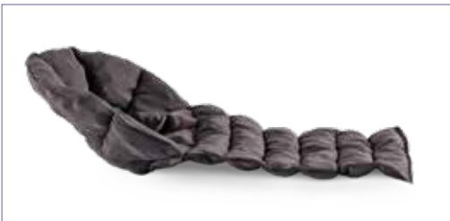
Chip Pad Bra Half