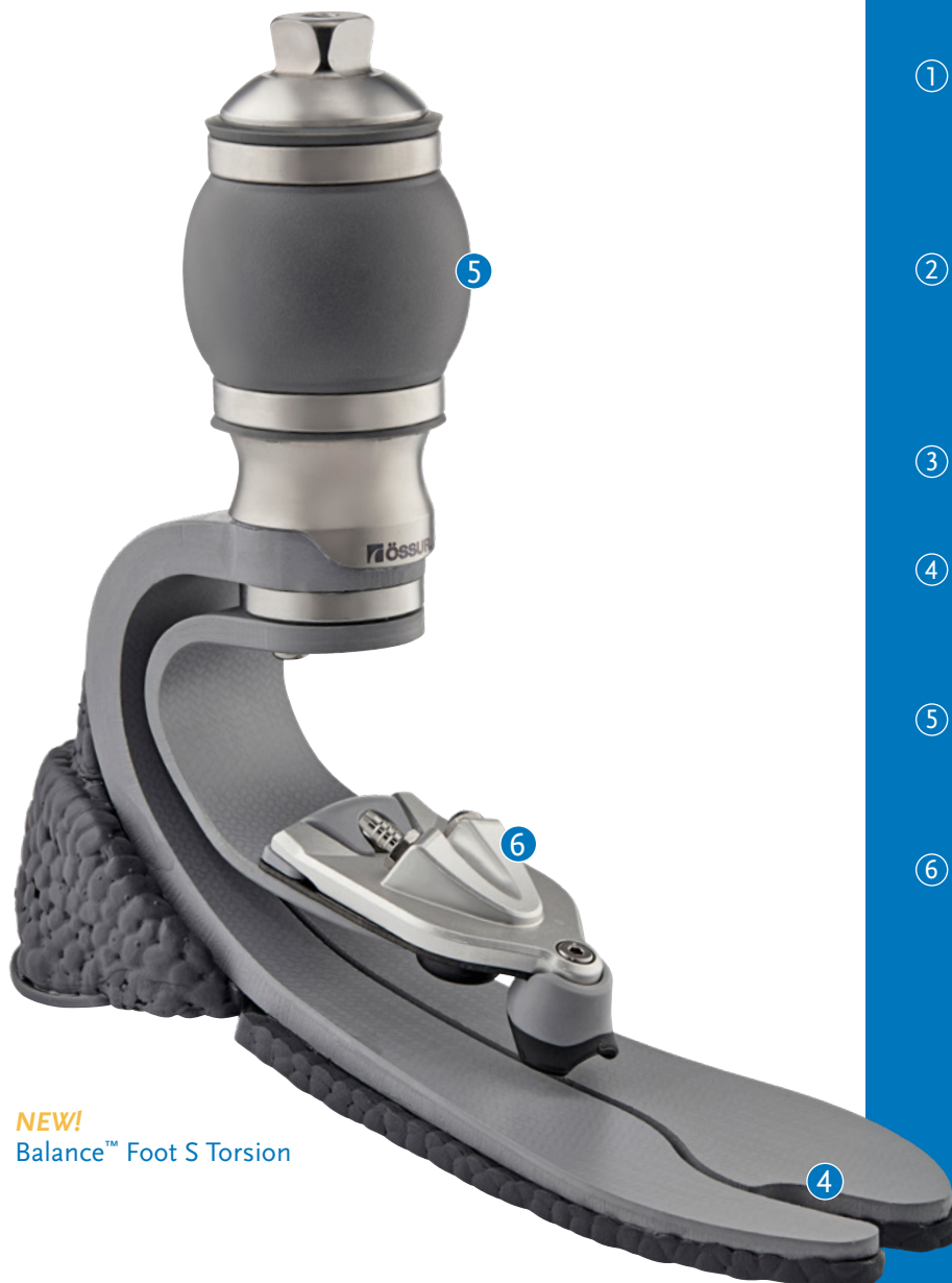
NEW! Balance™ Foot S Torsion