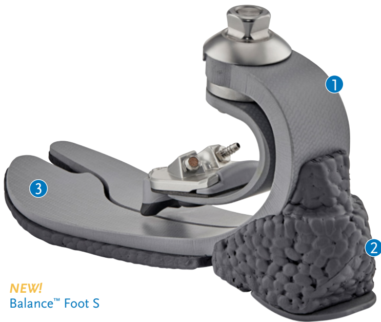
NEW! Balance™ Foot S